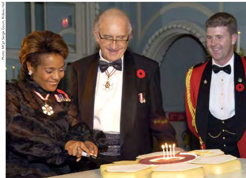
An edible work of art: Their Excellencies cut the anniversary cake at the dinner following the 100 th investiture of the Order of Canada on October 26, 2007. To highlight this important anniversary, a special menu was served to the recipients, inspired by the meal served at the 1967 Order of Canada dinner.

Her Excellency the Right Honourable Michaëlle Jean, C.C., C.M.M., C.O.M., C.D. Governor General of Canada