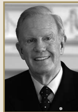
Ted Rogers, O.C.

The Chancellery of Honours wishes to acknowledge the generous contribution of the late Ted Rogers, O.C., for broadcasting Order of Canada ceremonies across the country. Since his investiture in 1991, a video copy of each Order of Canada investiture ceremony has been sent to recipients.