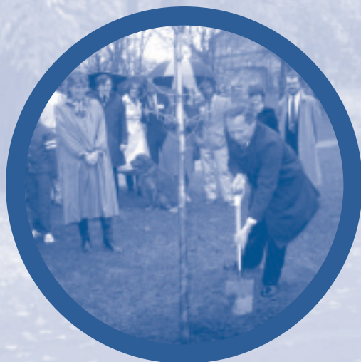
Governor General Edward Schreyer during the planting of a tree to mark his term of office at Rideau Hall