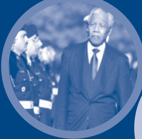
Nelson Mandela during his visit to Rideau Hall (1998)