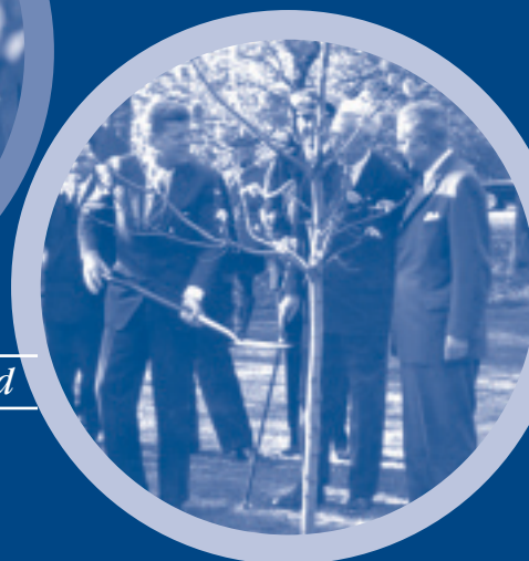
John F. Kennedy during the planting of a tree in his name (1961)